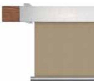
ALLUMINIO - LEGNO